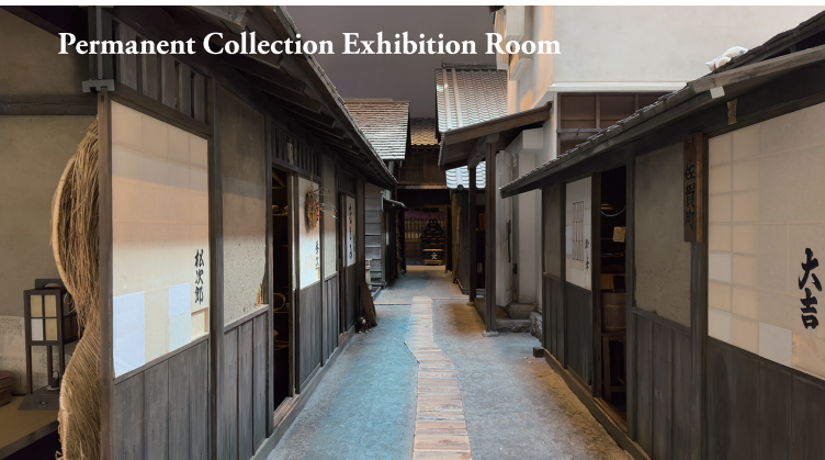
It reproduces the townscape of Fukagawa-Saga Town during the late Edo Period (Tempo, 1830-1844). The transition of a day is produced by sounds and lights. Exhibition items are replaced every season to enable you to enjoy the exhibition room throughout the year.