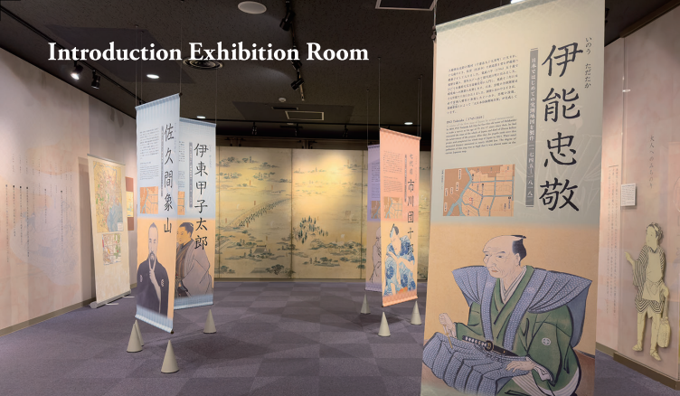
The museum introduces historical persons related to the area and the chronology of Fukagawa.