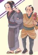
Fertilizer Wholesaler "Tada-ya"